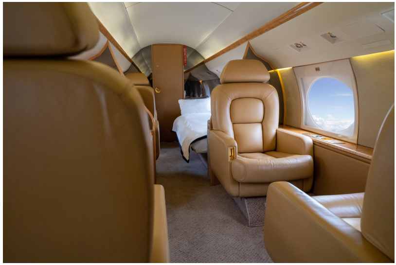
THESE SPECIFICATIONS ARE PRESENTED AS INTRODUCTORY INFORMATION ONLY. THEY DO NOT CONSTITUTE REPRESENTATIONS OR WARRANTIES OF ANY KIND. ACCORDINGLY, YOU SHOULD RELY ON YOUR OWN INSPECTION OF THIS AIRCRAFT TO VERIFY CORRECTNESS. THE AIRCRAFT IS SUBJECT TO PRIOR SALE, AND/OR REMOVAL FROM THE MARKET.